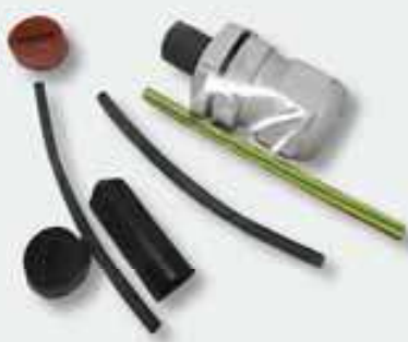
Connection and end resistor set